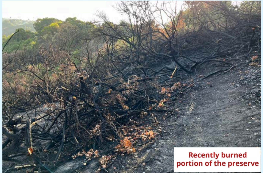
Recently burned portion of the preserve