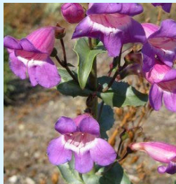
Showy Penstemon