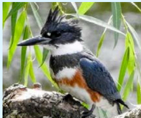
Belted Kingfisher

Protection of the preserve is not only important for the entire San Diego ecosystem but also improves the beauty and serenity of your neighborhood, providing a visual buffer typical of the topography and vegetation unique to Carlsbad and Oceanside.