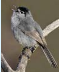
Coastal California Gnatcatcher