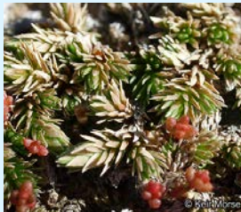
Ashy Spike-moss

Protection of the preserve is not only important for the entire San Diego ecosystem but also improves the beauty and serenity of your community, providing a visual buffer typical of the topography and vegetation unique to San Marcos.