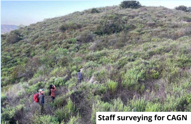
Staff surveying for CAGN

This year, we conducted protocol surveys for the federally threatened coastal California gnatcatcher (CAGN). Surveys consisted of three visits during the known breeding period to focus on monitoring coastal sage scrub habitat. A single male CAGN was observed in the north parcel, but no other individuals were detected. Protocol surveys for CAGN will be conducted every 5 years with the next survey in 2029.